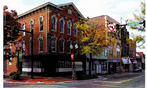
Scene number 1 on map as it appears in 2023. Southwest corner of State Street and S. Broadway Avenue Salem, Ohio

Layout and some copy adapted from THE SALEM NEWS April 23, 1987