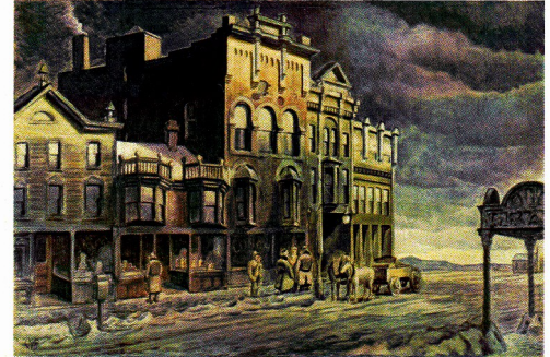
"The Edge of Town" 1921 - 1941

His name is firmly established in the history of American art. And Salem, Ohio (a place that inspired him long after he left here) will continue to keep his memory alive.